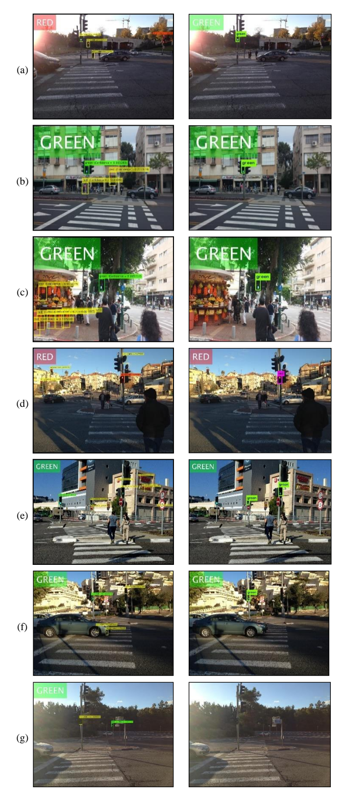
Fig. 4. Example object detection results of Faster R-CNN (left column) and Tiny YOLOv2 (right column). Candidate objects are marked with a bounding box and a confidence score. Final relevant pedestrian traffic light detection (based only on one frame without temporal infromation) is given in the uper left corner of each image.

In this section, we compare object detectors in terms of detection accuracy and running time. We also report the detection accuracy of pedestrian traffic lights in video. Table 1 compares the object detectors described in Section III – the first variant (based on Faster R-CNN) and the second variant (based on YOLOv2 or Tiny YOLOv2). The first variant was implemented in MATLAB under Windows. The second variant uses the official YOLO implementation in the Darknet framework under Linux. Results were obtained with cross-validation with 80% training set, 10% validation set and 10% test set. As shown in Table 1, both variants detect pedestrian traffic lights with high accuracy and operate in real-time. The second variant has higher precision and recall values and substantially lower running time compared with the first