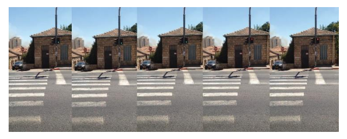
Fig. 2. Consecutive frames from a video sequence in our video dataset. Note that traffic light switching is abrupt. In this example, in frame 1 to 3 the light is green and in frame 4 it turns to red.